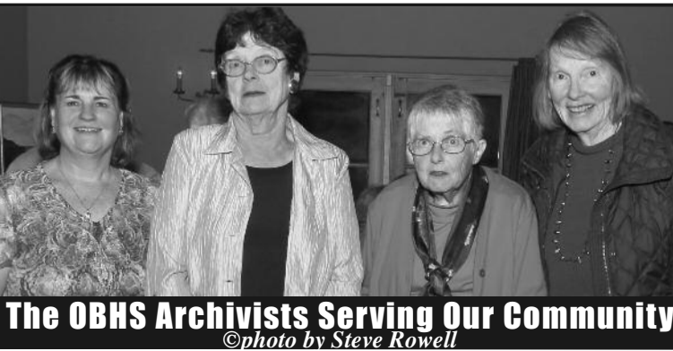
The OBHS Archivists Serving Our Community

Help PRESERVE OB's HISTORY! THE OBHS ARCHIVES WAS FOUNDED TO PRESERVE THE HISTORY OF OCEAN BEACH AND THE PENINSULA.