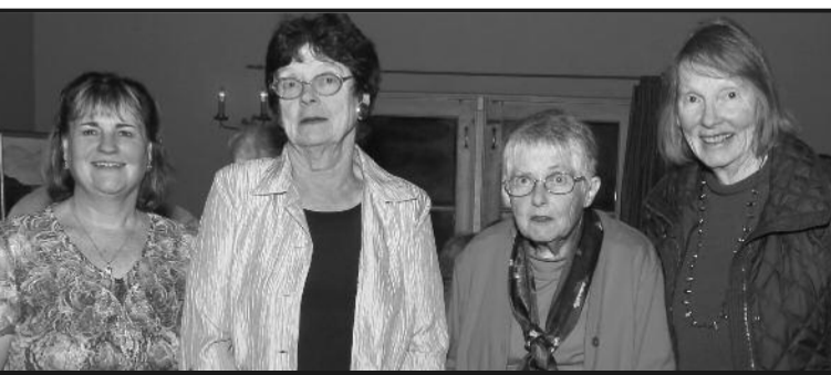
The OBHS Archivists Serving Our Community

PRESERVE OB’S HISTORY! THE OBHS ARCHIVES WAS FOUNDED TO PRESERVE THE HISTORY OF OCEAN BEACH AND THE PENINSULA.