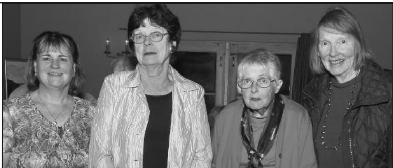
The OBHS Archivists Serving Our Community

PRESERVE OB’S HISTORY! THE OBHS ARCHIVES WAS FOUNDED TO PRESERVE THE HISTORY OF OCEAN BEACH AND THE PENINSULA.