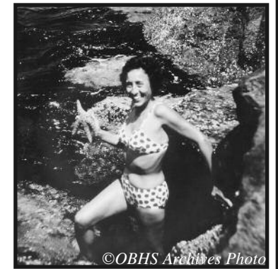
Ocean Beach tidepools were known for mussels, starfish and abundance of sea life.

Sea Scrolls Notes from the Ocean Beach Historical Society Vol. XXI No. 5 Published Bimonthly