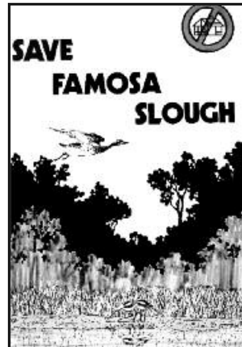
Above, Mid-1980s Poster used to help Save Famosa Slough