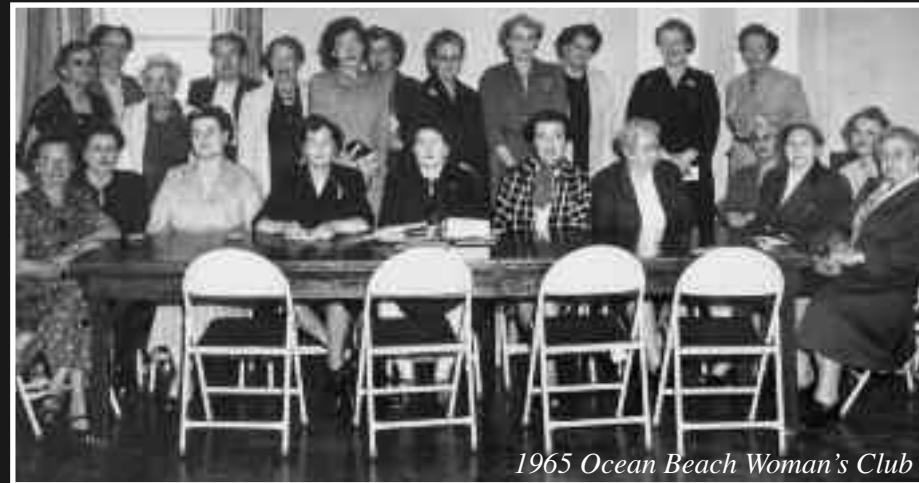
1965 Ocean Beach Woman's Club