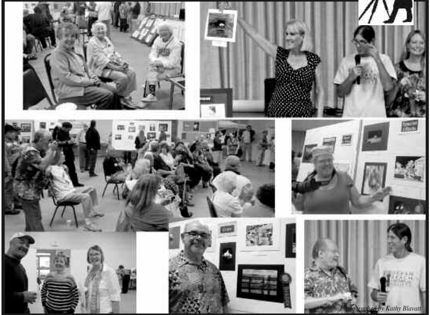
Photographed by Kathy Blavatt