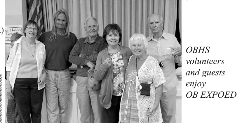
OBHS volunteers and guests enjoy OB EXPOSED!