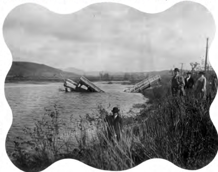
Local flood damage is a reoccurring theme throughout our history.