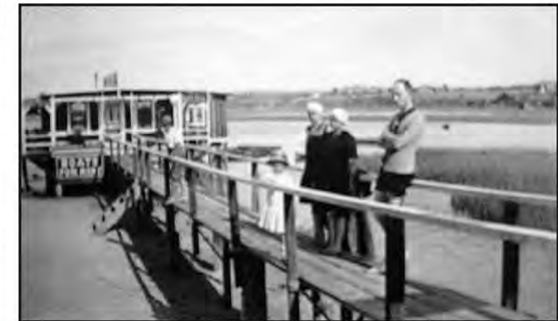
Historical Photo of Falses Bay, Where the San Diego River Mouth and Rob Field are today.